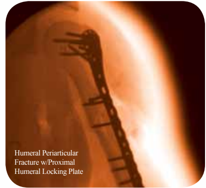
Humeral Periarticular Fracture w/Proximal Humeral Locking Plate