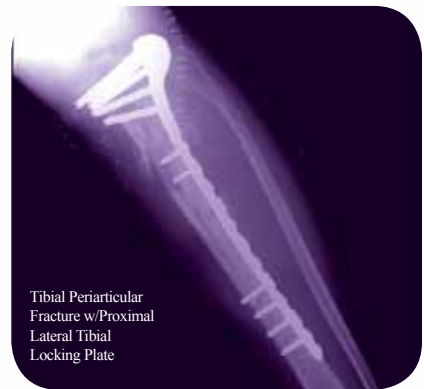
Tibial Periarticular Fracture w/Proximal Lateral Tibial Locking Plate