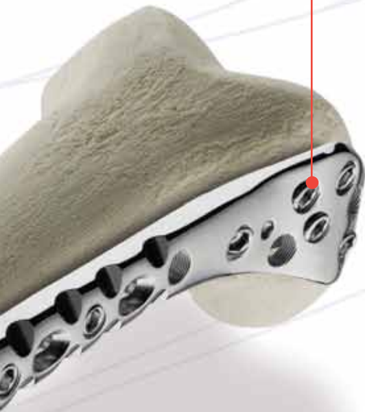
Periarticular Self-Tapping Cortical Bone Screw

The locking plate design does not require compression between the plate and bone to accommodate loading. Therefore, screw purchase in the bone can be achieved with a thread profile that is shallower than that of traditional screws. In turn, the shallow thread profile allows for screws with a large core diameter to accommodate loading with improved bending and shear strength.