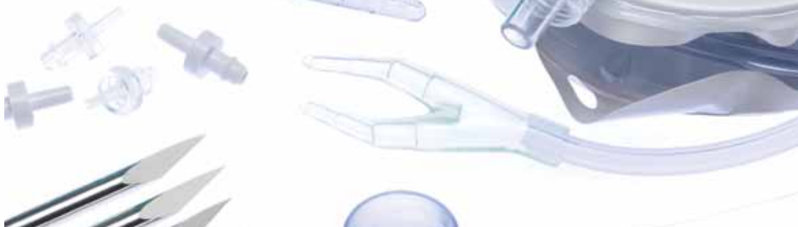
Systems and accessories for wound drainage